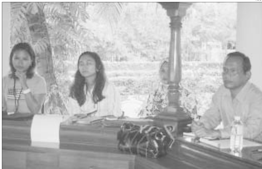
The Indonesia-Malaysia-Thailand group discussing issues at the Siem Reap Workshop

legal instruments is a major hurdle in recognizing rights.