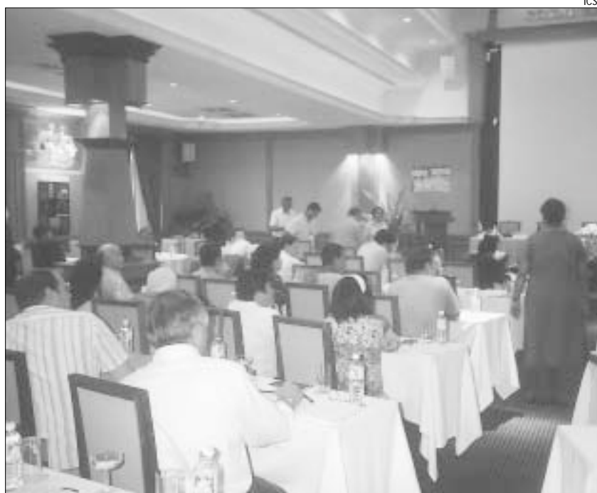
Participants discussing the adoption of the Siem Reap Statement, which stressed just, participatory, self-reliant and sustainable development