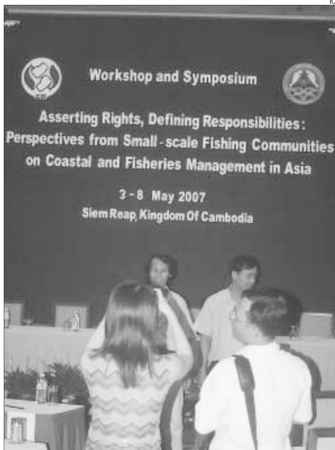
As the Siem Reap meet ended, several delegations, like this one from Vietnam, used the banner as a backdrop for photo shoots

Ultimately, what is being requested is a non-transferable community right—not only to use resources, but to decide on how they are to be used. With this comes the responsibility of stewardship, of equity of access and allocation within communities, Allison concluded.