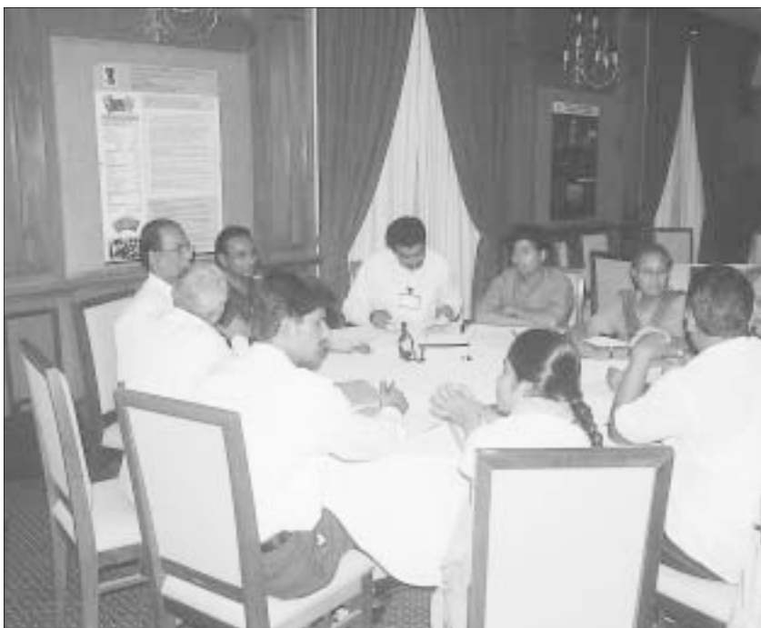
Participants from South Asia at the group discussion session during the Siem Reap Workshop

Day 2 began with the groups presenting the key points of their discussions. The Cambodia group mentioned that although community fisheries have been introduced in the country, lack of awareness of fishery laws and related