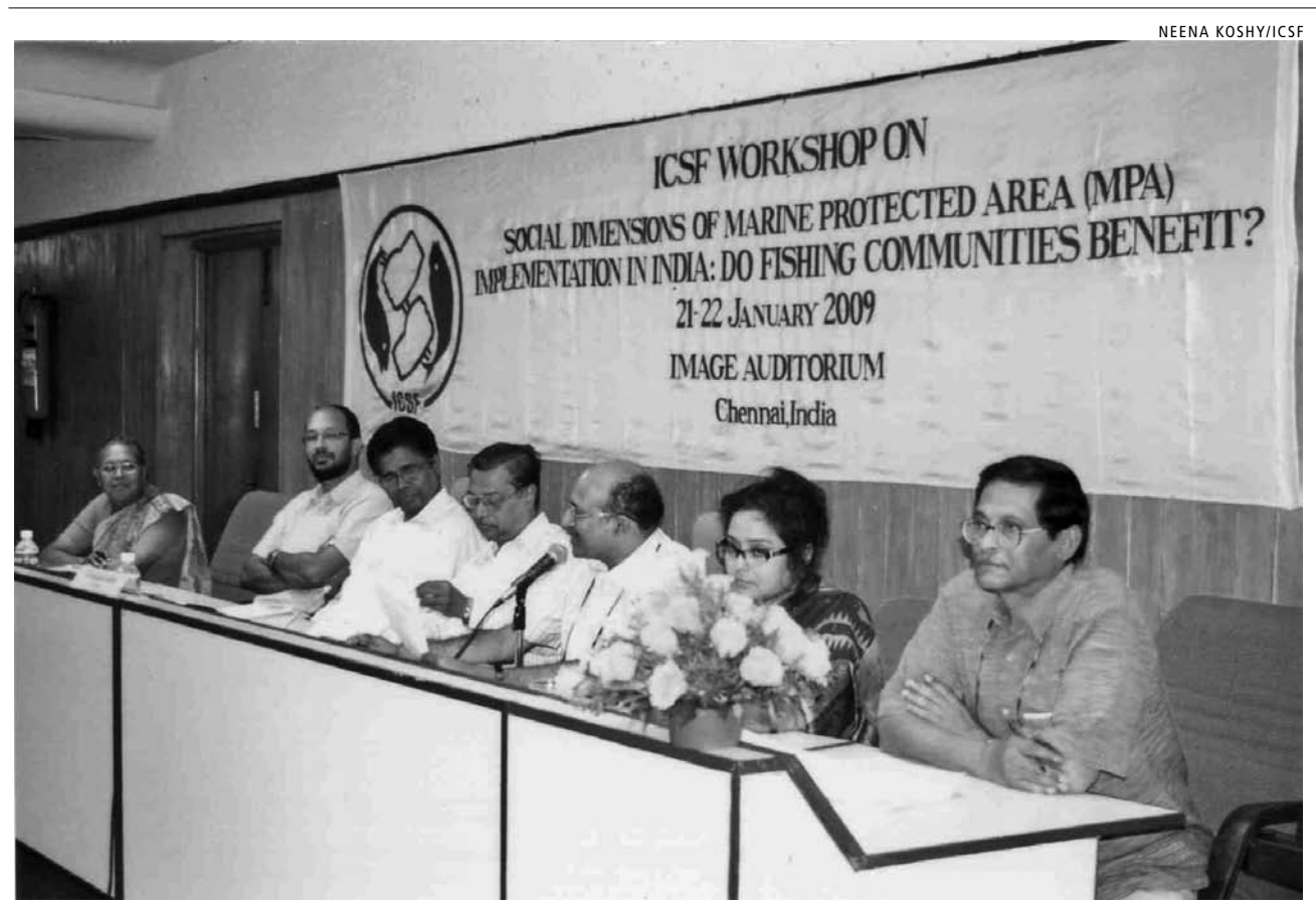
Panel discussion on "The Way Forward" at the end of the ICSF workshop on Social Dimensions of Marine Protected Area Implementation in India

both fishery and non-fishery management concerns, and draws on international and national legal and policy frameworks.