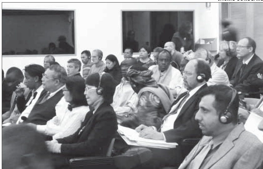
A scene from the Side Event on Agenda Item 9: Securing sustainable fisheries: Towards responsible fisheries and social development