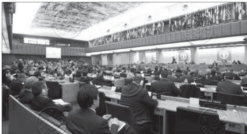
Opening session of the 28th Session of the Committee on Fisheries (COFI) of the Food and Agriculture Organization of the United Nations (FAO)