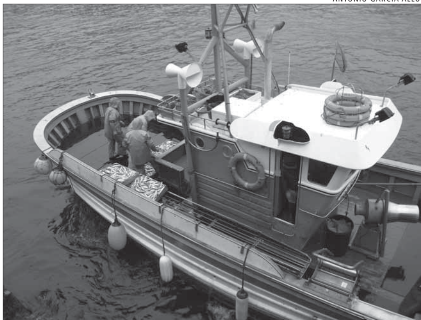
Fishermen preparing the bait on a longline fishing vessel in Cedeira, Galicia, Spain. Small-scale fisheries management in Galicia is sometimes led by fishermen's organizations