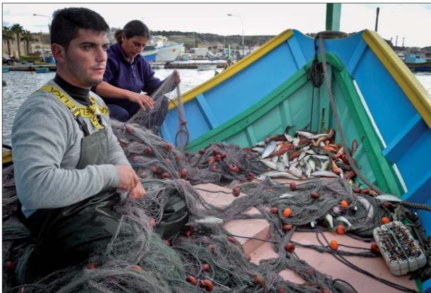
Small-scale fishers in Malta. FAO advocates for adequate consideration and inclusion of the small-scale fisheries perspective in international development initiatives