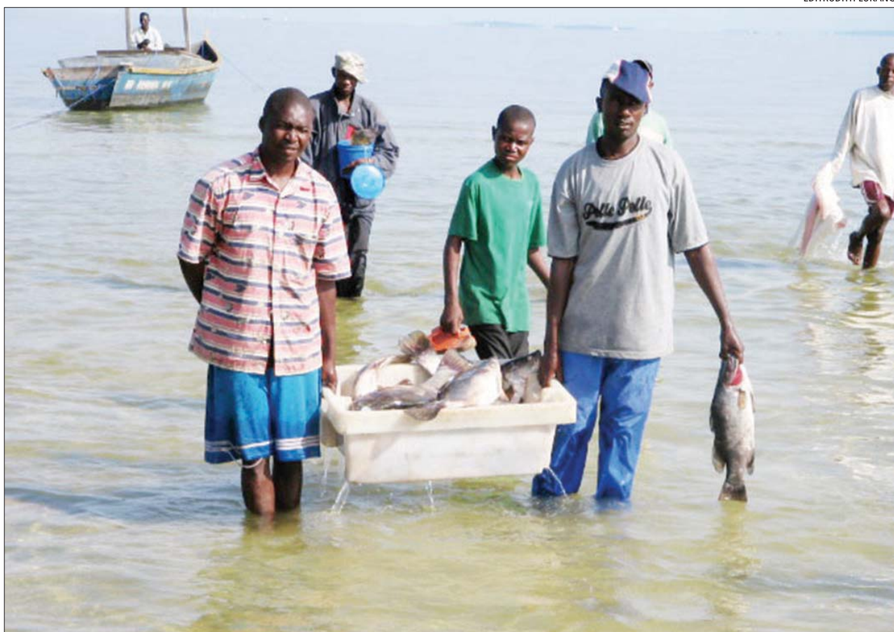
Fishermen at a Lake Victoria fish landing centre. Both HIV and the Nile perch have a long history in Lake Victoria, lengthier than many realize