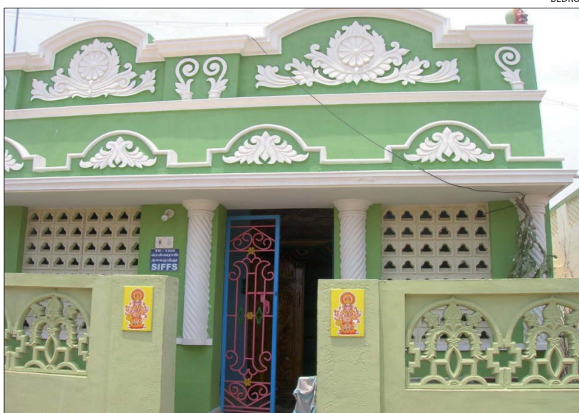
The building of the South Indian Federation of Fishermen Societies (SIFFS) at Nagapattinam, where some exceptional sites are being projected as models for others to emulate