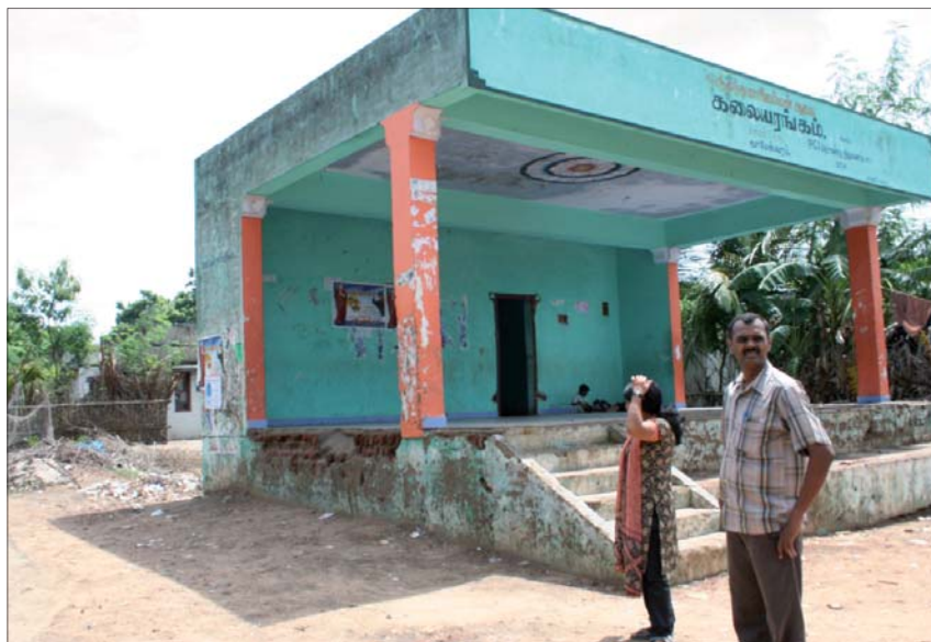
Community centre at Nagapattinam. The large scale of construction without a sound technical support system has meant that the construction quality was not uniform

places, with the drainage system getting clogged and waste water overflowing.