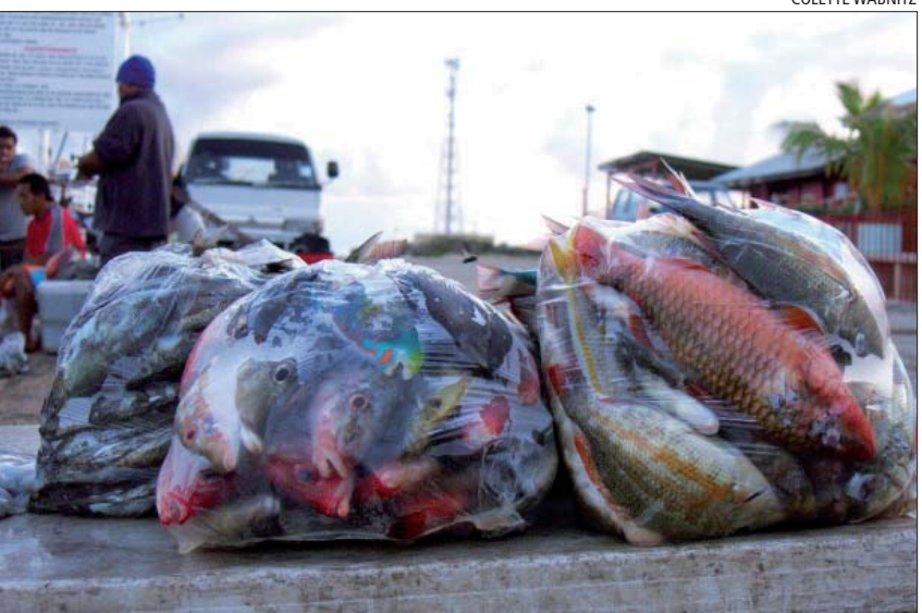
Local reef fish on sale at Nukulaofa, Tonga. Examples of indigenous 'resurgence'—efforts for the assertion of rights over traditional resources and self-determination—are increasing

An increasingly important policy framework at international and national scales is the concept of the Blue Economy, which emerged from the UN Rio +20 Conference