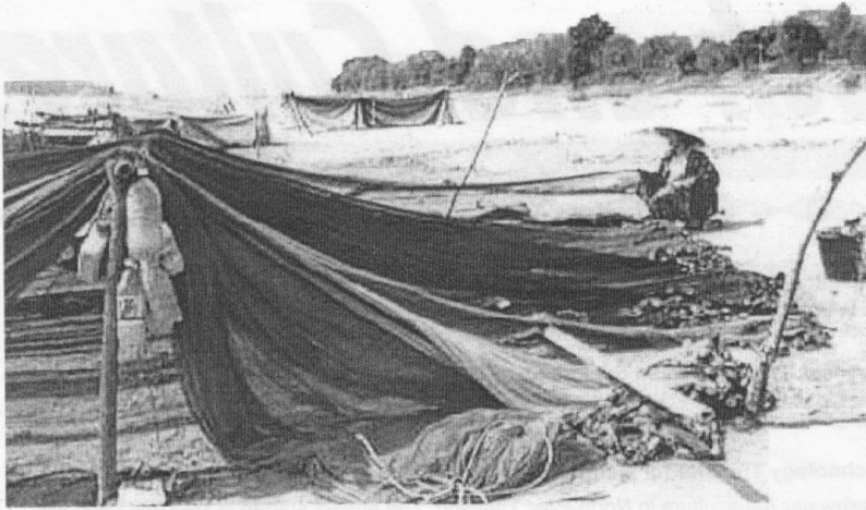
A woman joining her husband to fish in the Mekong at Nakhorn Panom Province.

women's resource to maximise fisheries production in Thailand.