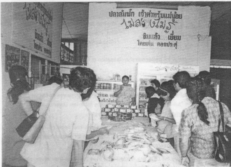
February 2002 post-harvest study trip in north-eastern Thailand.

In 2001, two meetings were arranged by the working group of the TWIF and the Thai National Coordinator to build up understanding about the Network among the DOF officers and to discuss future TWIF activities and the Network structure as follows: