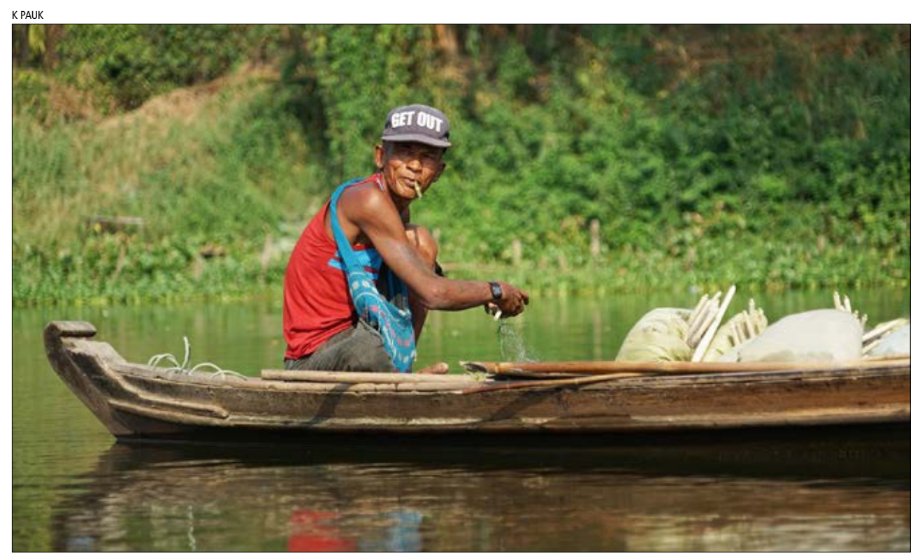
Fishing in the Ayeyarwaddy River. Protesting the junta's policies, people have stopped paying electricity bills and municipal taxes, and boycotted products from companies related to the military

projects restart at the community level, they should do their best to protect and resuscitate community organizations supporting SSF fishers. Development programmes and projects in the future will need a high degree of adaptability to re-engage SSF communities. A flexible engagement will bring the best outcomes for SSF communities, addressing not only the immediate problems like food insecurity but also contributing to the sustainability of SSF organizations. This will retain the scope for re-shaping fisheries governance along democratic lines.