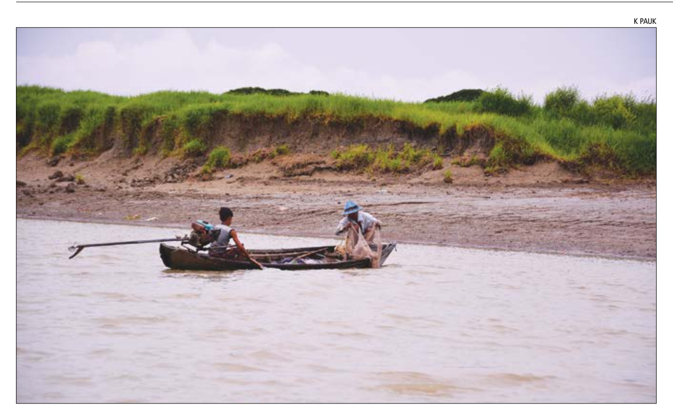
Father and son fishing in Mon state. Between 2014 and 2018, several coastal regions enacted fisheries laws that recognized community-based management by small-scale fishers and their organizations

military. This has resulted in declining income from tax collections for the de facto authorities after the coup.