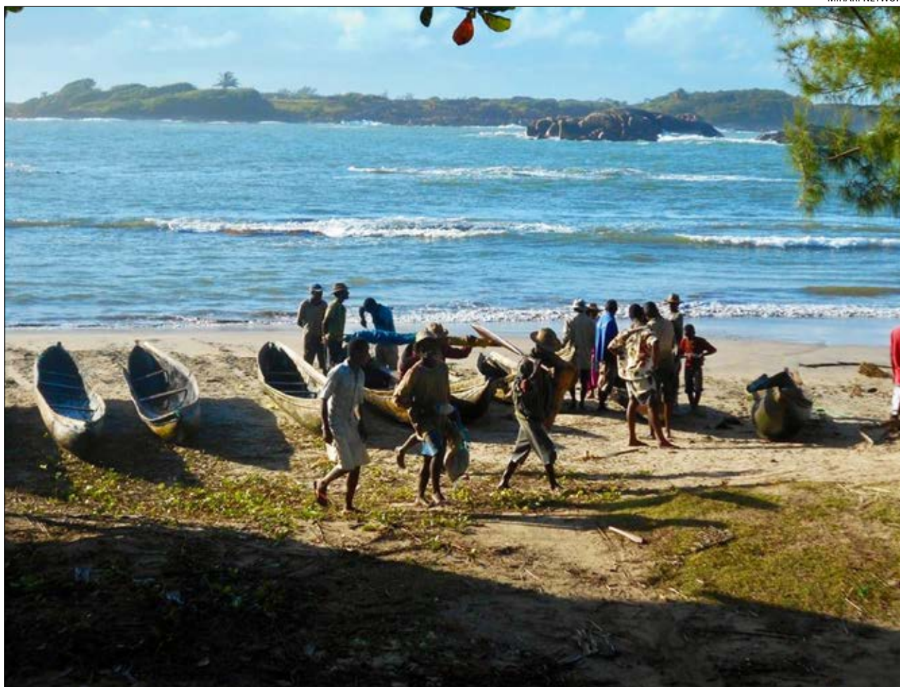
Men return from fishing in Madagascar. Significant proportions of small-scale fishing communities living close to the shore have been experiencing more frequent inundation and exposure to storms that destroy homes and livelihoods

spawn, increasing the risk of failure in fish recruitment (the process by which new individuals are added to a population) for species with restricted spawning locations. Cascading effects include rapid shifts in geographic distribution of important fish species. This may persist for years, leading to collapse of fisheries and aquaculture in some regions. The report also says that there is very high confidence that coastal eutrophication (overloading of nutrients in the water) and the formation of 'dead zones' are worsened by warming. These drive severe impacts on coastal and shelf-sea ecosystems. Ocean acidification especially threatens ecosystems such as coral reefs, and single-species fisheries such as lobster, oyster and clam.