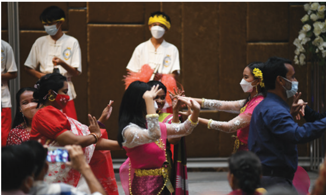
The participants of the workshop taking part in the ‘Kwan Khao’ dance performance by the Thai cultural group. The Sabadchai Drummers are seen in the background