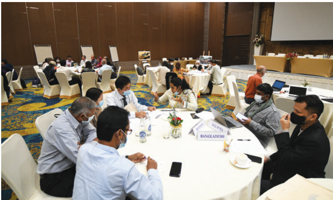
Participants engaged in group discussion on women and gender in small-scale fisheries

Respondents agreed that women's organizations needed more recognition. Women cooperatives provided them a safe space that could also be used for training. However, separated from the mainstream could affect them negatively in the long run. Numbers matter in cooperatives. They are essential to running insurance schemes, for example. It was not advisable to run cooperatives for women, and instead there needed to be a push to integrate women's groups into cooperatives.