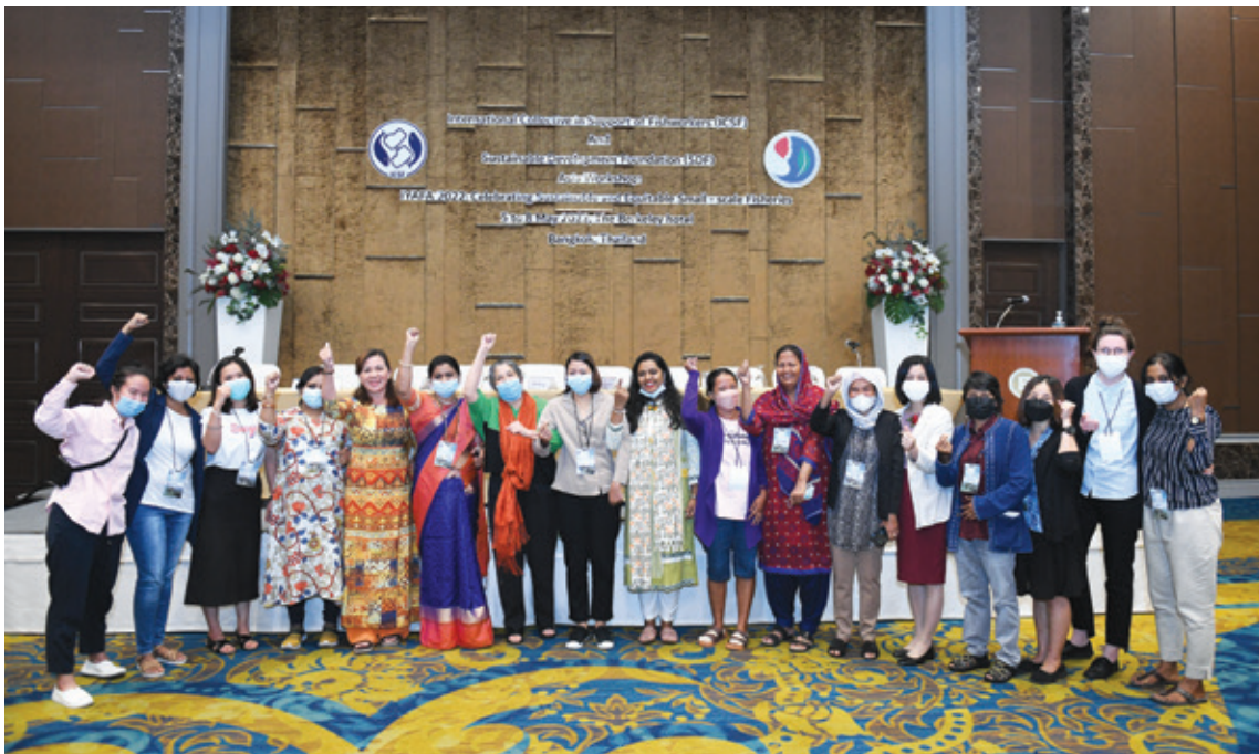
The women participants on the third day of workshop focusing on women and gender in small-scale fisheries. Building a platform for Asian small-scale fishworkers would be very helpful

Manas concluded the day's proceedings by detailing the next day's schedule. He requested that all women participants take a group photograph.