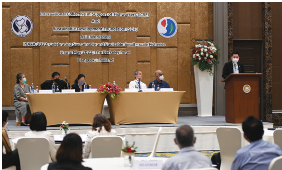
Taworn Thunaji, Deputy Director General, Department of Fisheries, Ministry of Agriculture and Cooperatives, Government of Thailand addressing the participants during the opening session

The sector, Panitnart said, was facing internal and external competition over the use of limited resources. SEAFDEC was collaborating with other organizations to support countries in South East Asia to enhance capacity building, promote good management and analyze the role of small-scale fisheries and marine resource management and development.