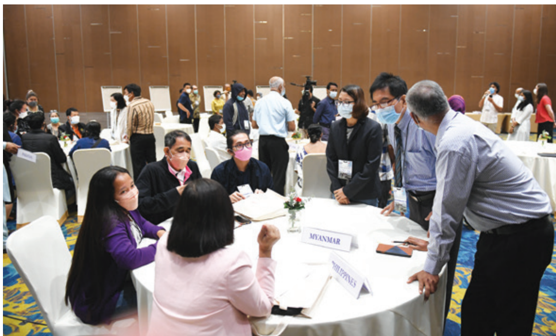
Participants from Myanmar and the Philippines discussing major challenges in accessing the resources in the country contexts.