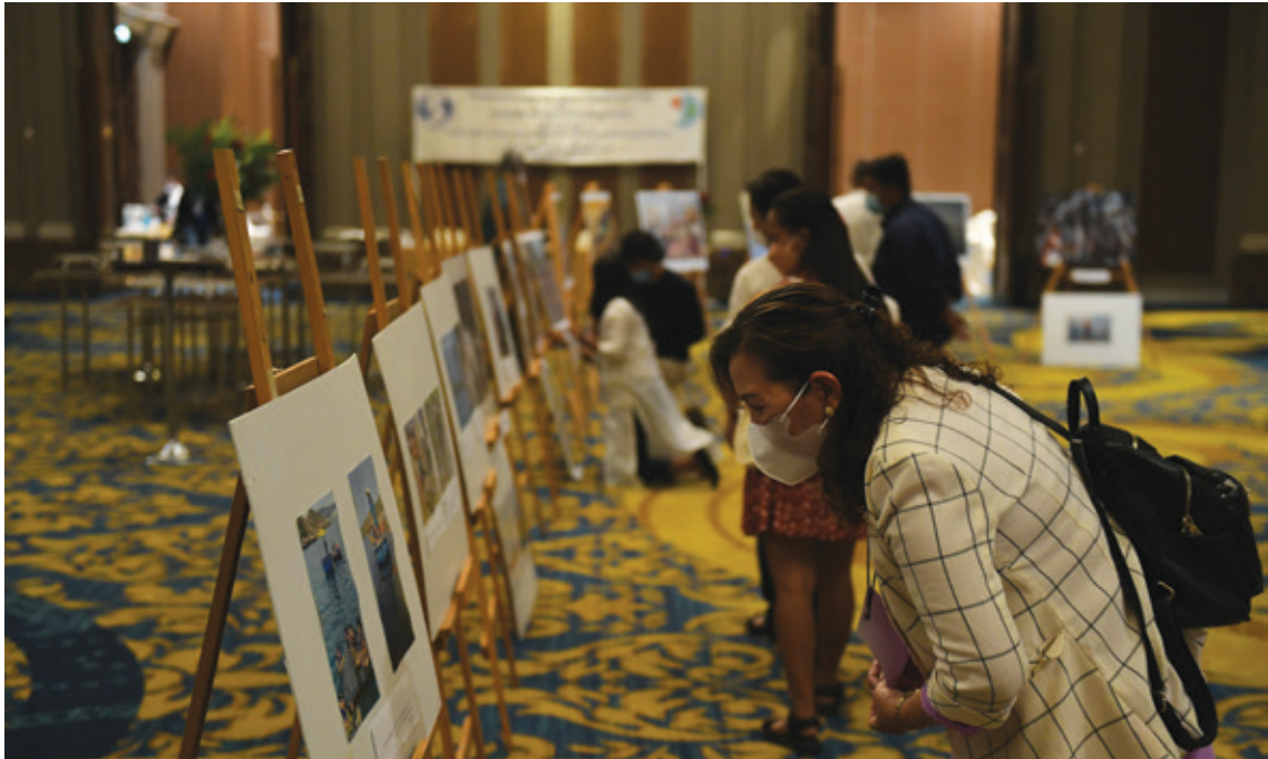
The participants taking a look at the photos exhibited in the workshop celebrating small-scale fisheries

from the participating countries, out of which 50 were selected for the final exhibition based on the quality and content. Ravadee then informed everyone about the cultural programme in the evening, and requested all to participate.