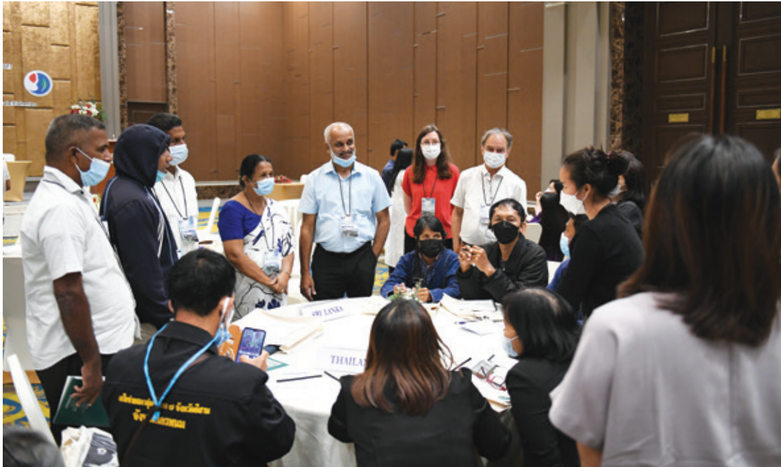
Participants from Sri Lanka and Thailand discussing major challenges in accessing the resources in their respective countries

In some coastal areas, where housing and land was legalized by the government, people held papers and deeds. In most of the country legal paperwork and status did not exist.