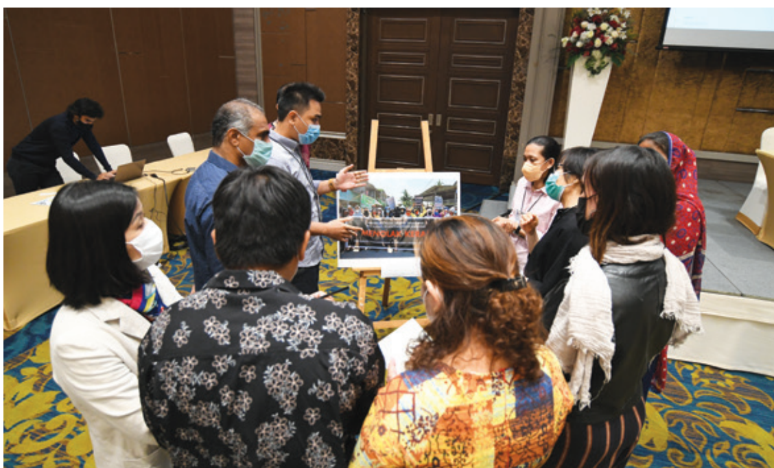
Participants exchanging views on the photos exhibited in connection with the discussion on women and gender in small-scale fisheries

Participants from all countries put together an exhibition of photographs that highlighted the role of women in fisheries.