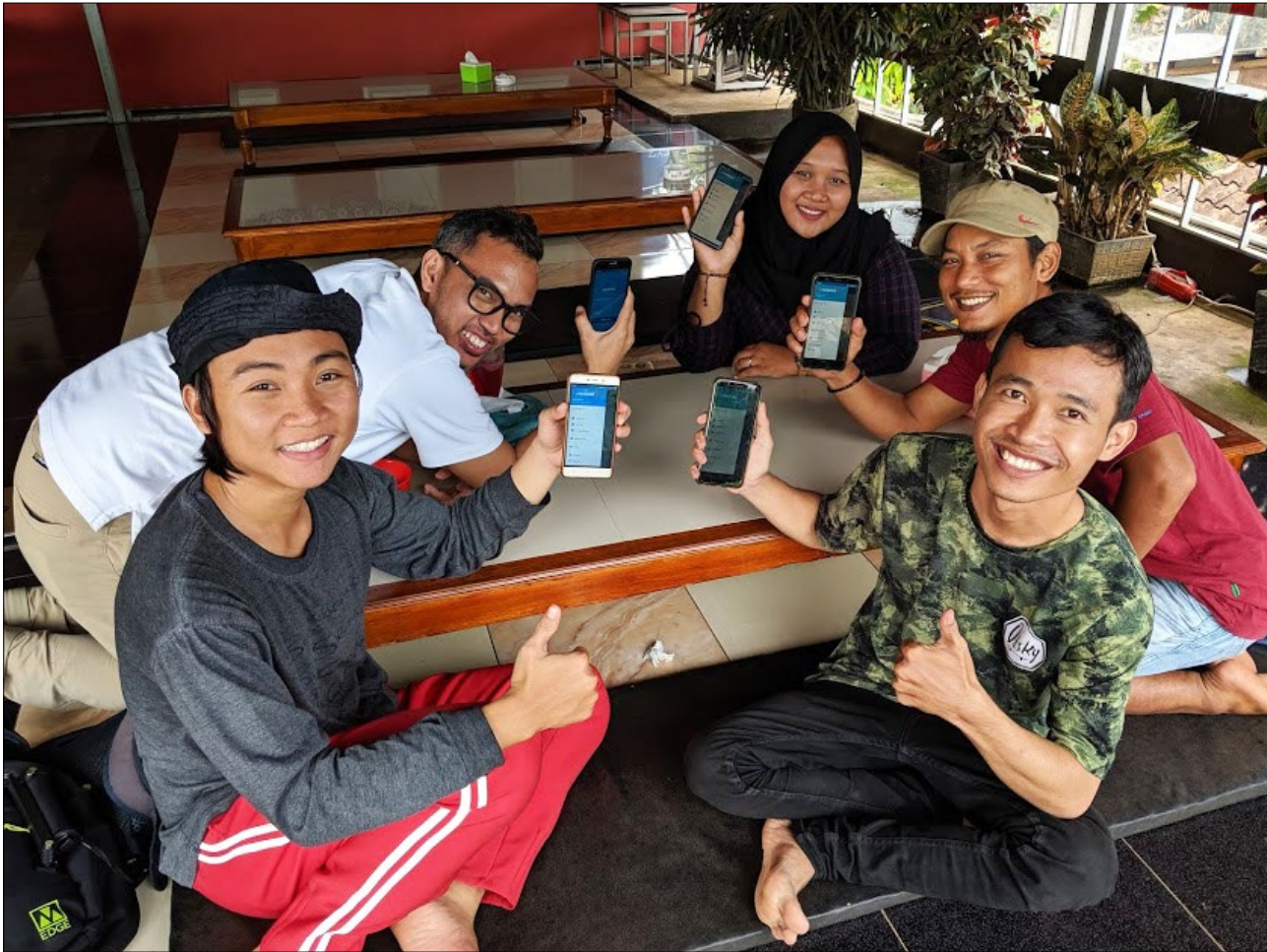
Blue Swimming Crab fishers in Indonesia working with the Smart Boat Initiative Programme. The SSF Hub is an online platform where people can learn, share and grow together. When on the Hub, people will be able to easily access tools and resources