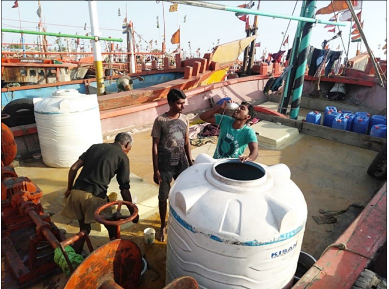
Srikakulam migrant fishers. While drinking water was supplied, a single well within the harbour premises was the only source of water for all non-drinking purposes