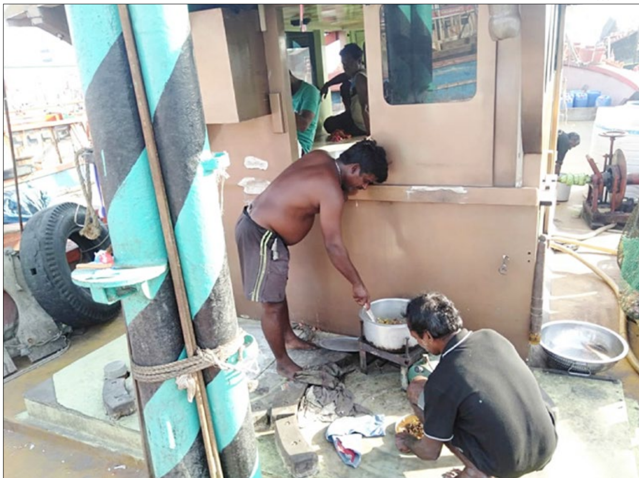
Srikakulam migrant fishers are working in Gujarat, India. The diet comprises a breakfast of freshly cooked rice with fish fry; lunch usually features rice and fish curry; dinner consists of chapati and fish curry. Vegetables are served with each meal on Saturdays