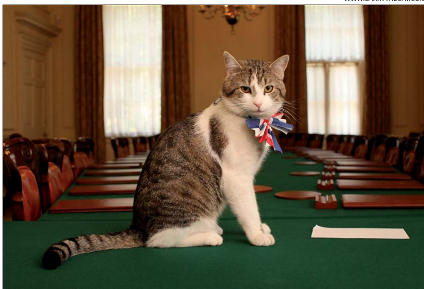
Larry, the No. 10 Downing Street cat, is now a seafood celebrity. Thanks to him, UK ministers will now eat sustainably sourced fish