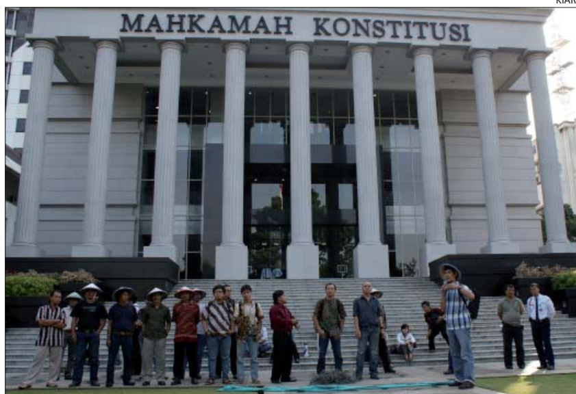
The Reject HP-3 Coalition in front of the Constitutional Court of Indonesia, campaigning for the rights of communities to access resources