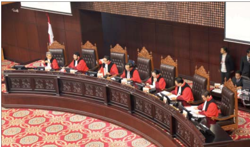
The Constitutional Court of Indonesia in session to discuss the annulment of HP-3 concessions

State power/ownership over natural resources for the greatest welfare of its people; is it in conflict with the constitutional guarantee regarding the right to life and livelihood for the coastal community (socioeconomic rights), and with the principle of non-discrimination and the principle of legal certainty and justice?