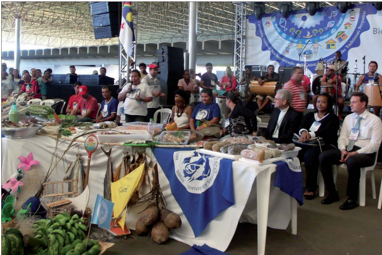
Fishworkers, representatives of social movements and officials of public bodies at the launch of the signature campaign for a new bill

spaces which are symbolic, religious, cosmological or historical sites".