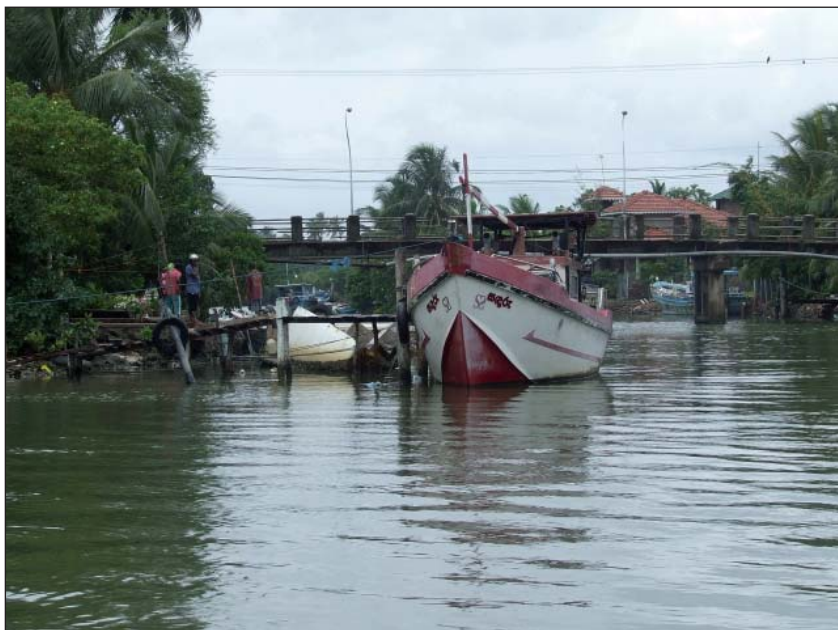
A boat anchored at the Negombo lagoon. The major problems facing the lagoon include the discharge of sewage and dumping of solid waste from homes and businesses