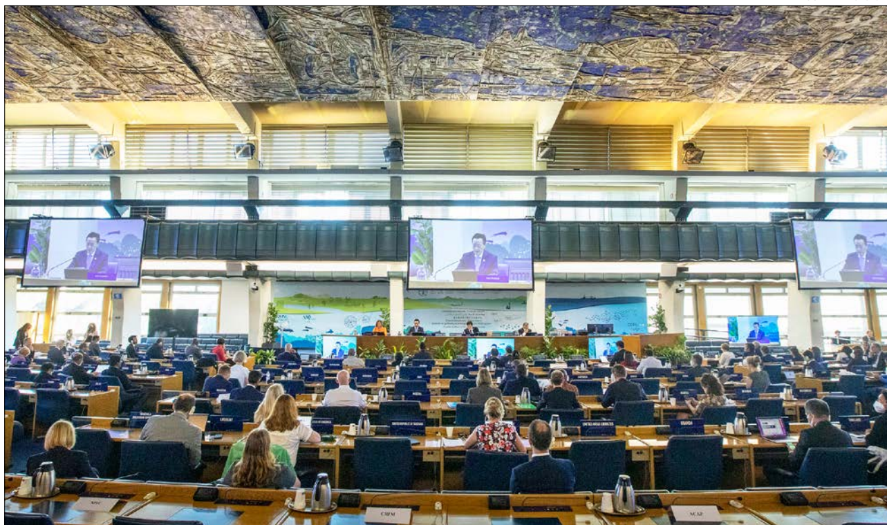
Qu Dongyu, FAO Director General inaugurating the 35th Session of the Committee on Fisheries (5-9 September 2022) at the FAO Headquarters, Rome

its concerns about the achievement of the Sustainable Development Goals (SDGs), considering the persistent discrimination against women, Indigenous People and other vulnerable groups in the sector. IPC reiterated its commitment to work closely with the governments and FAO in strengthening the implementation of the SSF Guidelines. It also called for mechanisms to deal with IUU in the traditional small-scale fishing zones.