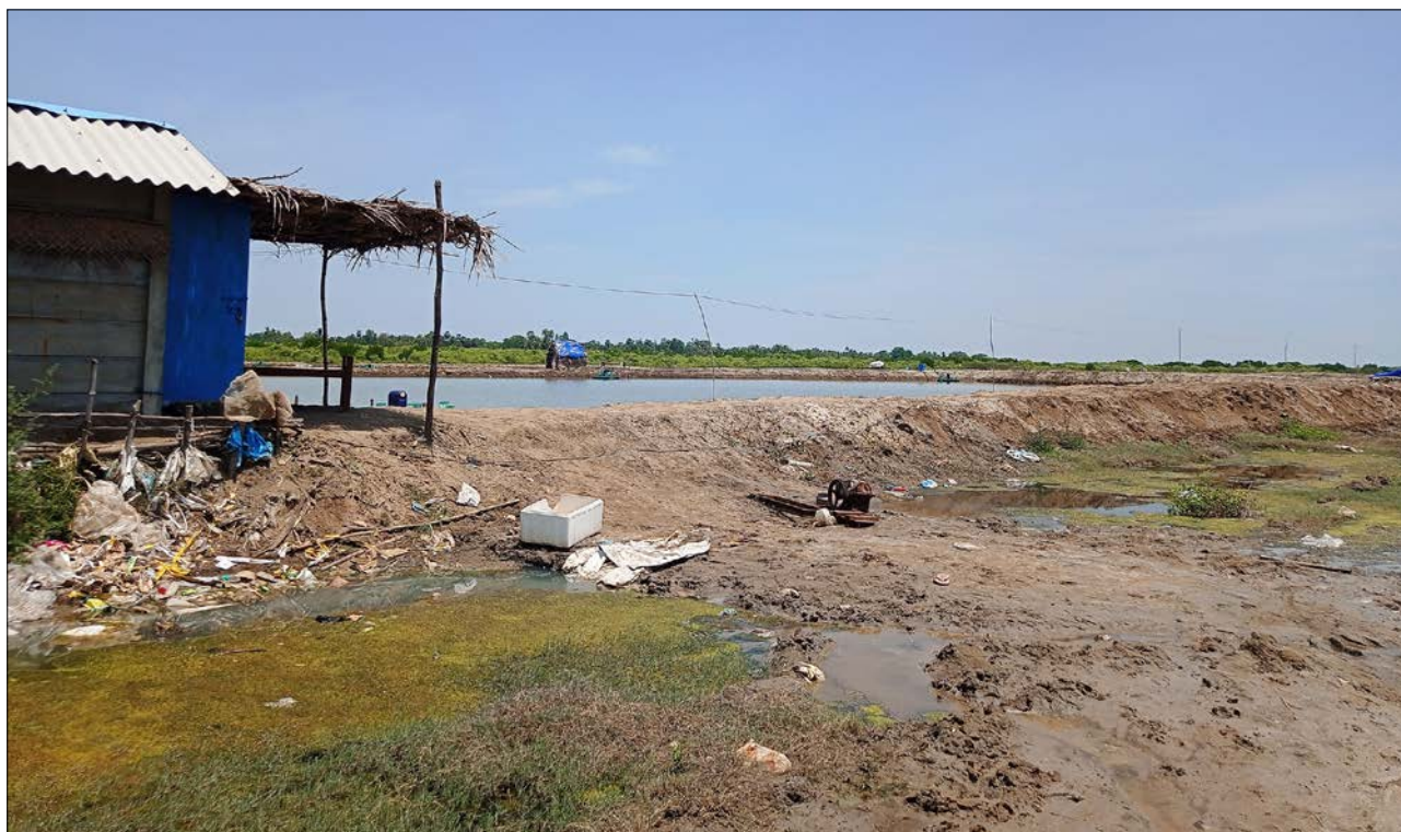
Many of the licensed farms in Pichavaram and T.S. Pettai are situated in ecologically sensitive areas in violation of the rules of the Coastal Aquaculture Authority. Farms do not maintain adequate spaces between ponds, contaminating water bodies and groundwater aquifers

means no electricity connection, but this does not prevent farms from operating.