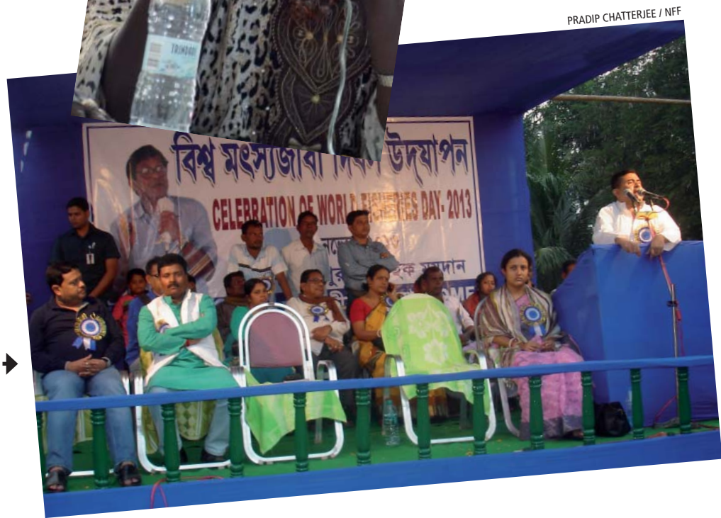
PRADIP CHATTERJEE / NFF