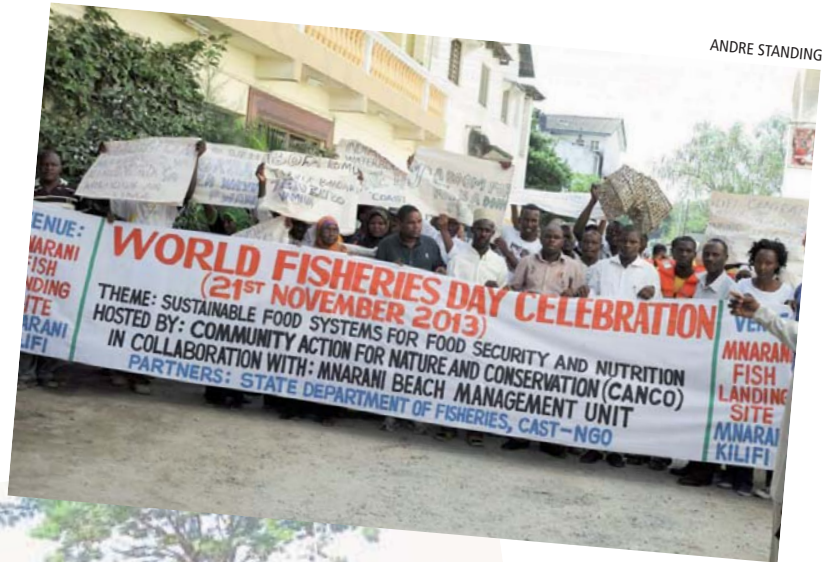
Fishworkers and their supporters in Kilifi, Kenya, taking out a march to celebrate World Fisheries Day