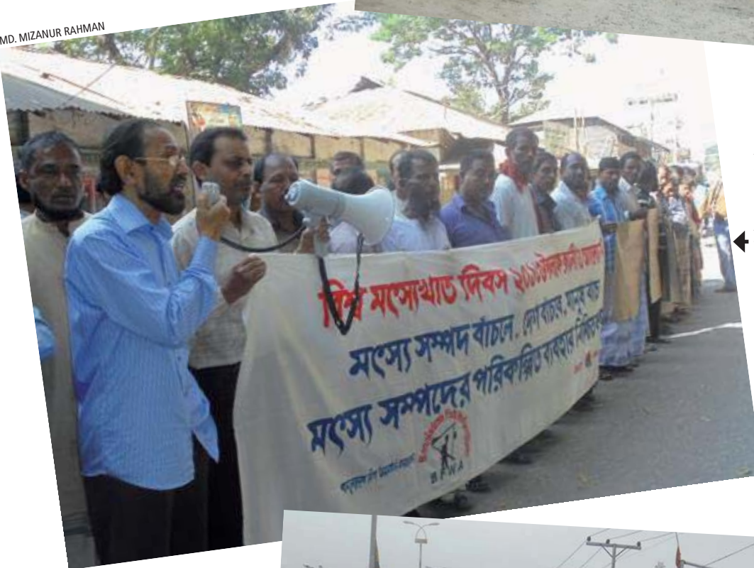
A human chain rally organized at Bhola, Bangladesh, by the Bangladesh Fish Workers' Alliance (BFWA)