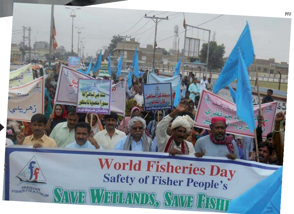
The Pakistan Fisherfolk Forum (PFF) observed World Fisheries Day through rallies, workshops and public meetings