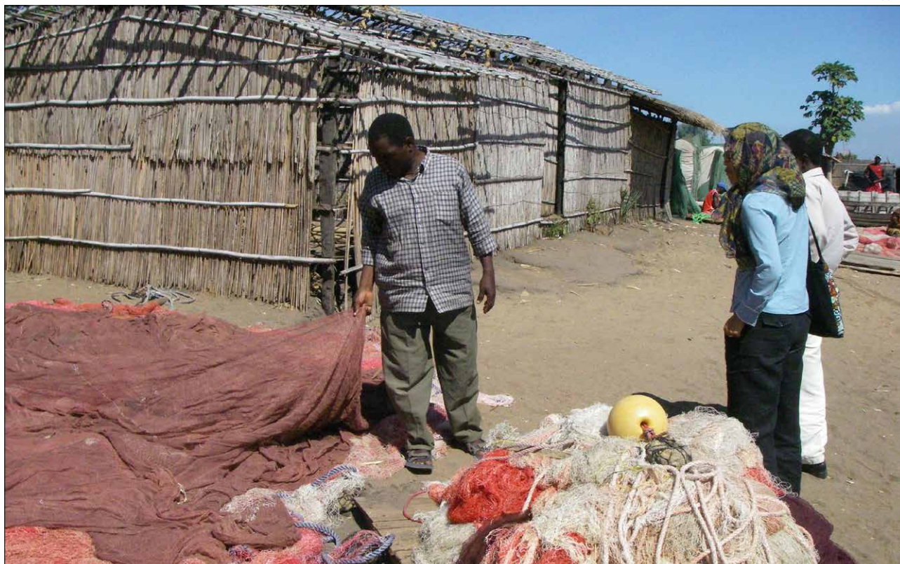
Fishing village in Malawi. Several closing events were held around the world, not only to recognize the importance of small-scale fisheries (SSF) and their contribution to food security and poverty alleviation, but also to pledge support

It emphasizes the need to look at the implementation of the SSF Guidelines from institutional and legal perspectives. Specifically, it examines the existing conditions in countries that can support the implementation of the SSF Guidelines. It does so in terms of laws and policies and whether these are directly or remotely related to SSF. The book illustrates this through reviews and appraisal of national-level policy and legal frameworks in 15 countries.