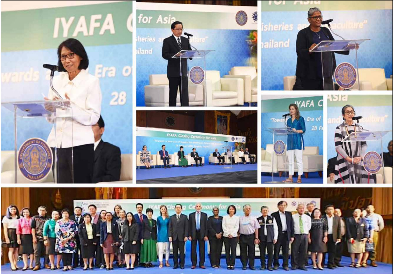
IYAFA Closing Ceremony for Asia. About 300 people from more than 40 countries joined this two-hour hybrid event including presentations from fishers' groups and civil society organizations (CSOs), non-governmental organizations (NGOs), government and inter-governmental organizations, and research institutions and academics

Collective in Support of Fishworkers (ICSF) and numerous other partners, are clear evidence of this effort. SSF has no shortage of bright spots with numerous studies, projects, networks and fisher-driven and community-based programmes. They contribute towards enhancing the knowledge and understanding about SSF, illustrating their values and contributions, and highlighting the critical role they play in supporting multiple Sustainable Development Goals (SDGs). Great work has been done to strengthen SSF organizations and build their capacity for better governance. Major advances have been made in theories, policies and practices that promote viable and sustainable SSF around the world. Therefore, the 2024 SSF Regional Symposium is an opportunity to share these bright spots to energize and inspire others. At least two more regional symposiums will be held later in the year.