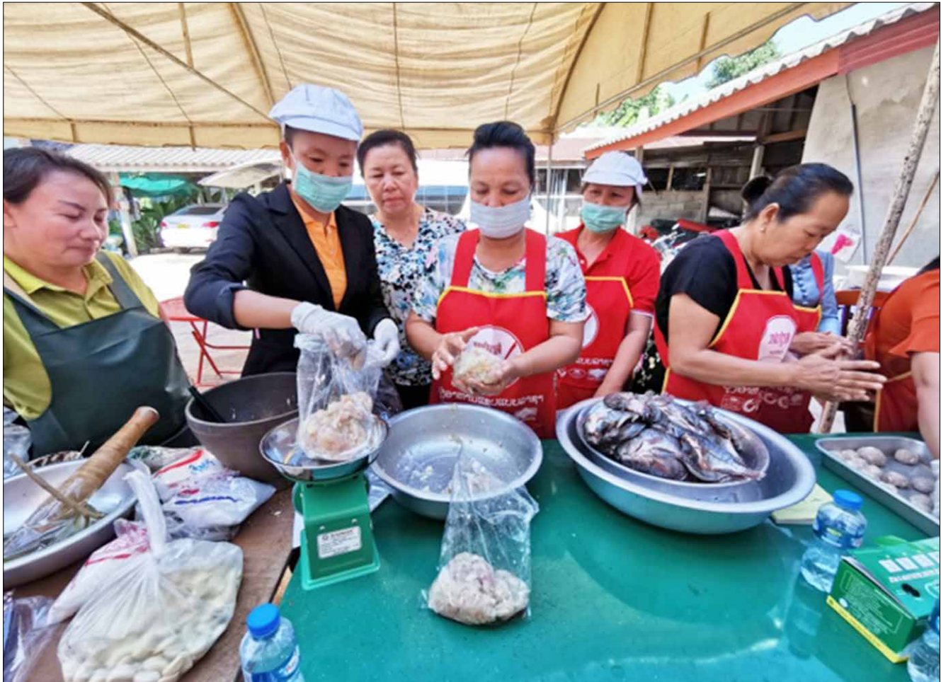
Fish processing group in Namxouang reservoir, Lao PDR. The processing group helped to promote women's empowerment, contributing much-needed incomes to households and communities