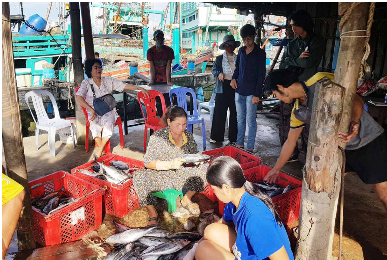
At the fish landing site, women intermediary collects fishery products from fishers, and redistributes them to different destinations in Cambodia. Women played a crucial role in aggregating and redistributing fish, but this is neglected in documentation and reporting, making it impossible to develop policies that address their needs

M.U Rekha, T.T Ajith Kumar and Kuldeep K Lal documented the life of women subsistence fishers in Lakshadweep, India, engaged in an initiative by ICAR-NBFGFR (National Bureau of Fish Genetic Resources) to encourage community ornamental shrimp rearing as an additional income generating activity. The breeding and seed production of shrimps was standardized by the Bureau, and the objective of the activity was to increase family income through women-oriented activities. Where access to export markets is limited, this model may promote employment generation for people using native resources.