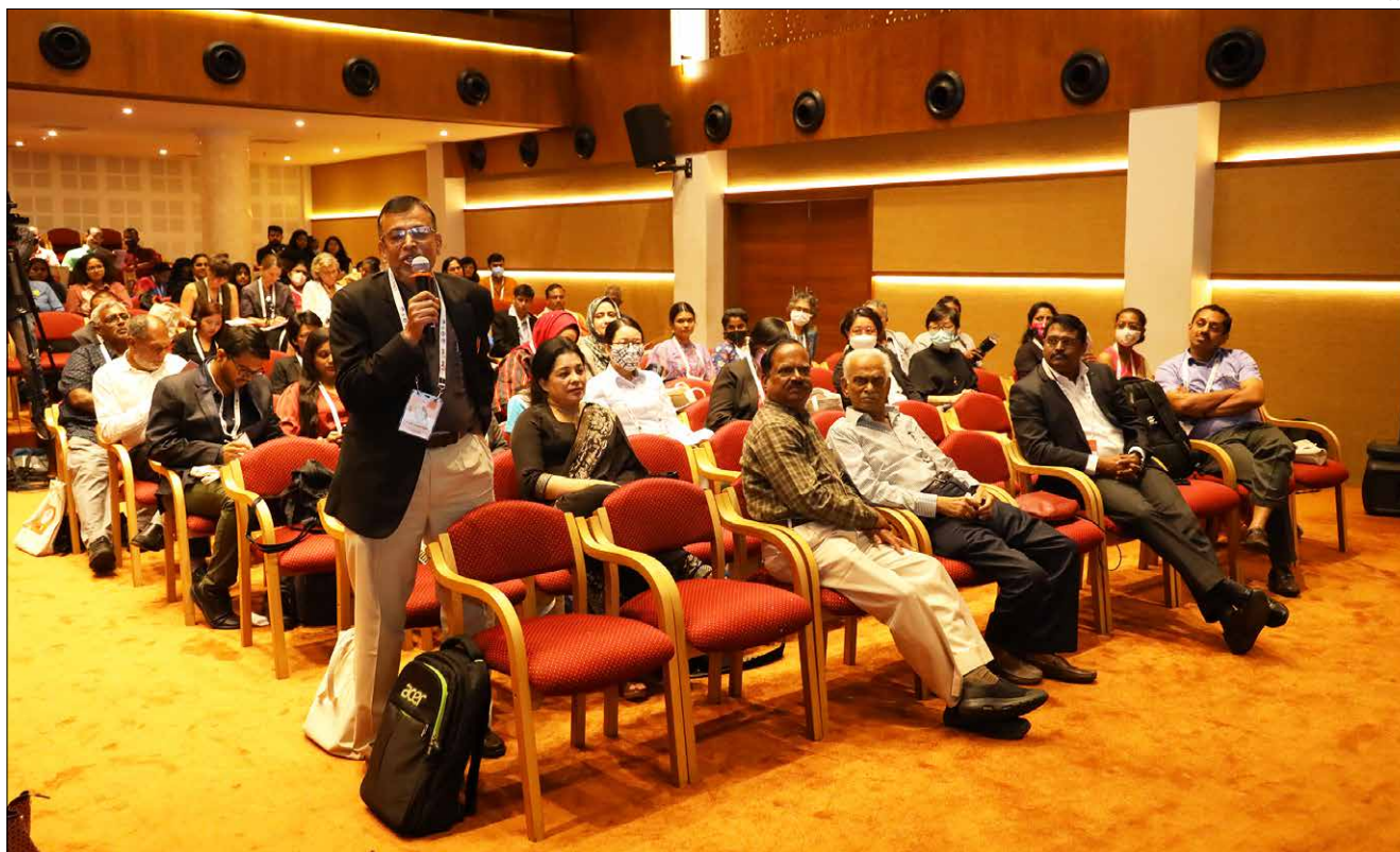
A panel discussion. The six thematic sessions, ten special sessions on projects, initiatives, narratives and stories from different parts of the world were presented in panel discussions

utilization of fishery resources and livelihood security of fishers and identify key issues for a proposed fisheries management plan for the Nam Xouang reservoir. Two womens' groups from villages close to the reservoir were trained in fish pre-processing and processing activities as an additional source of income, following which the groups were given support to prepare four types of fish products: wrapped sour fish ( som hor ), sour fish ( som ton ), sour fish eggs ( som khai pa ), and fermented fish ( pa dek ). These products were prepared using knife fish ( Chitala sp. ) and sold in local markets and to the local school for inclusion in the school lunch programme. The project helped promote women's empowerment, contributing much-needed incomes to households and communities.