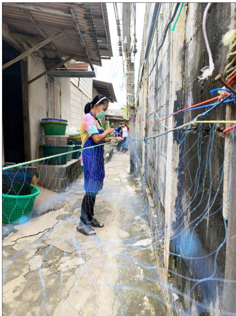
Women in Crab gill net making in at Koayod village Rayong Province Thailand. Development of entrepreneurship among women in fisheries and aquaculture is to be supported