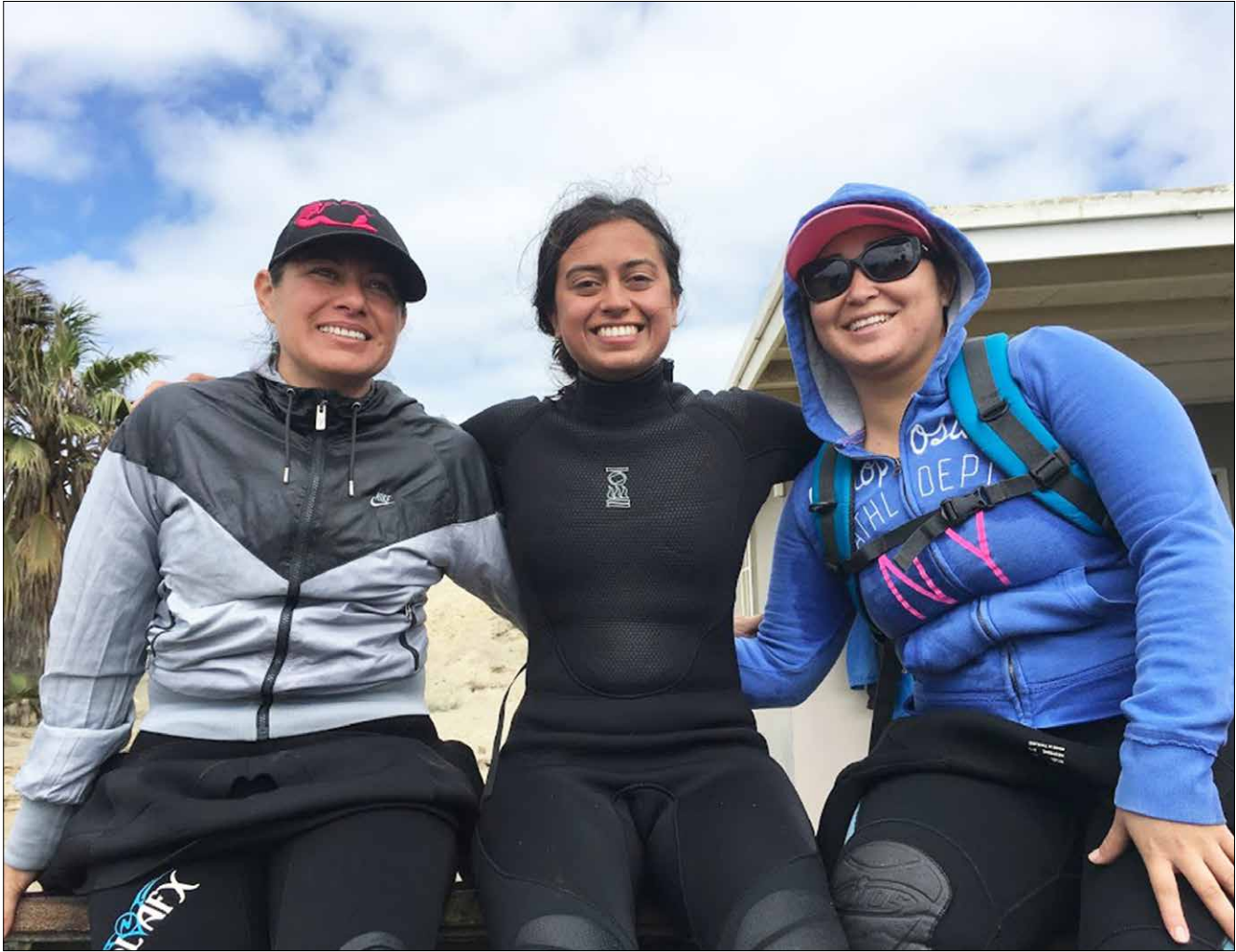
A woman diver group from de Mexican North Pacific, during their oceanographic monitoring. Success stories of women who have achieved what they have due to sheer grit and determination are inspirational to other women and show a way forward