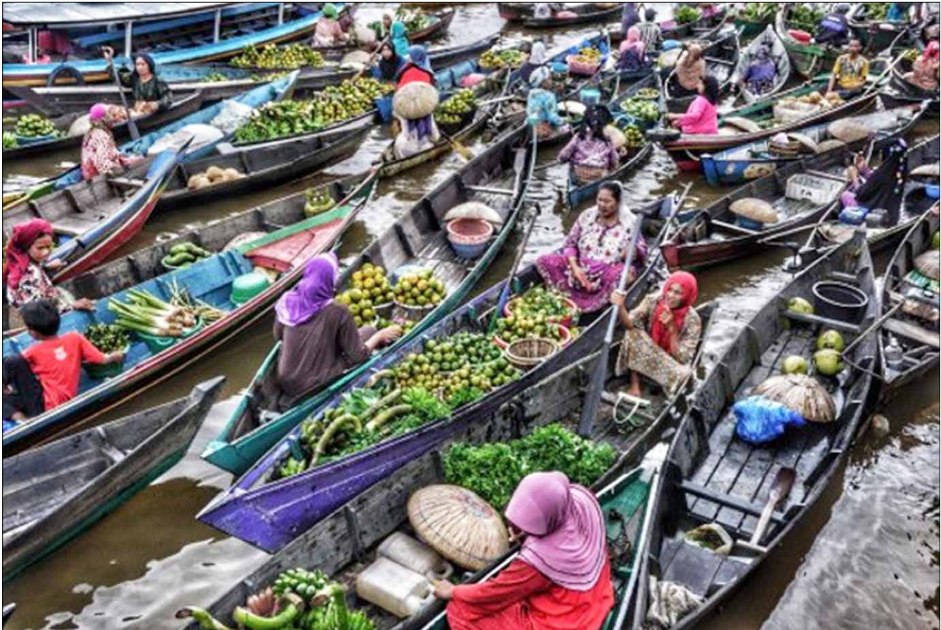
Floating market in Banjarmasin, Indonesia, in early morning showing women participation in productive role. Participants also agreed that standardized tools and methodologies are needed for generating gender-based data in aquaculture and fisheries to inform policy and planning

gender-based data in aquaculture and fisheries to inform policy and planning. More specific recommendations are provided in the last section.