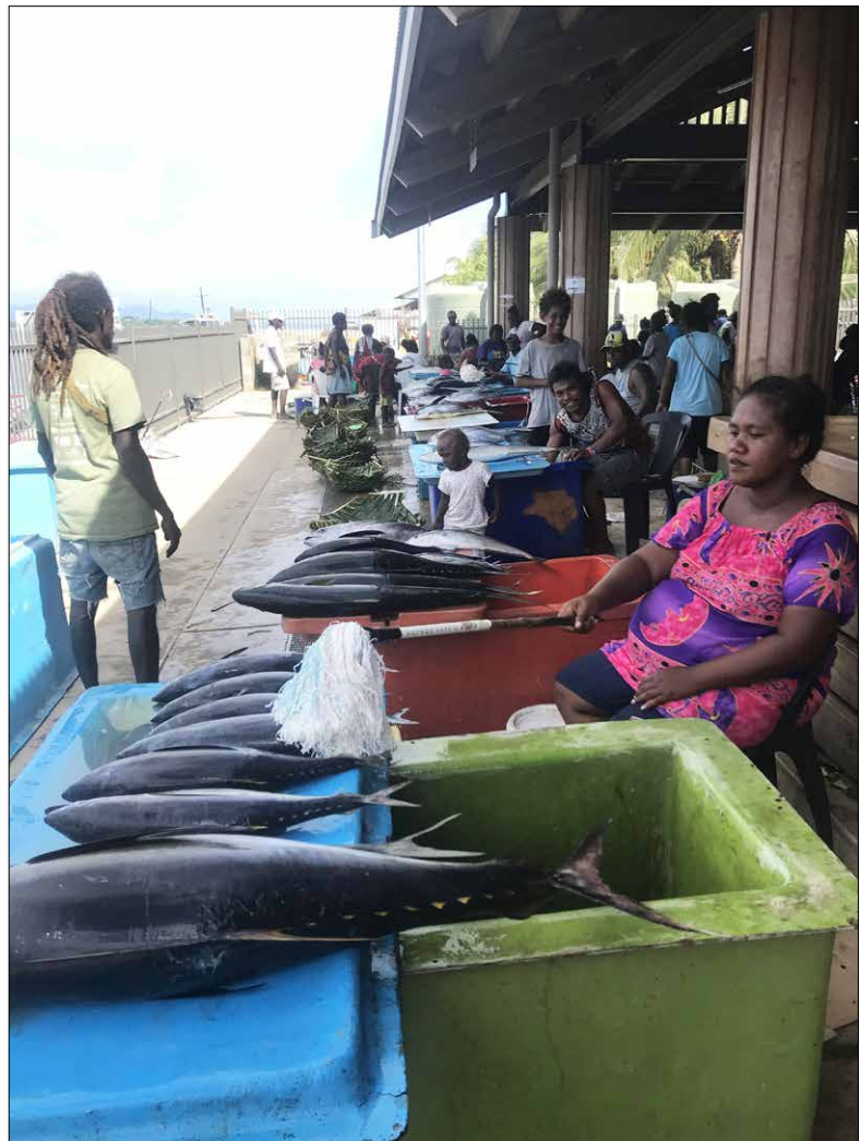
Fisherwomen selling tuna, Gizo Market, Solomon Islands. Need for access to safe shelters and wash facilities, especially for the differently abled, the elderly and pregnant women