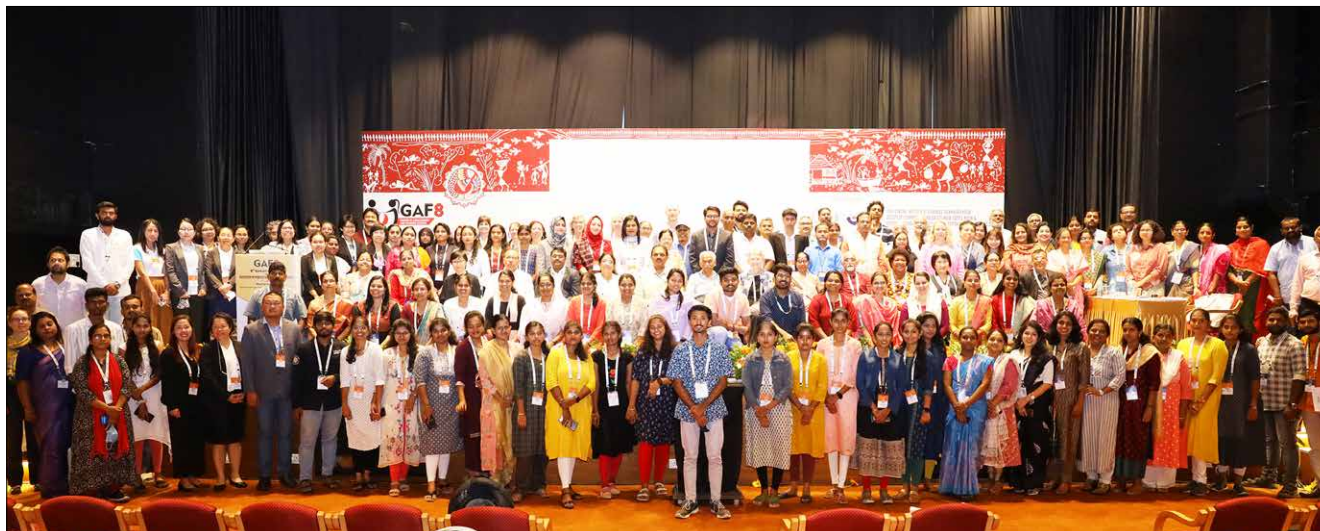
A group photo. The discussions during GAF8 led to common ground, such as the need for new approaches to document and analyse gender issues in aquaculture and fisheries, including human rights, intersectionality, and transformative, participatory, and gendered value chain approaches