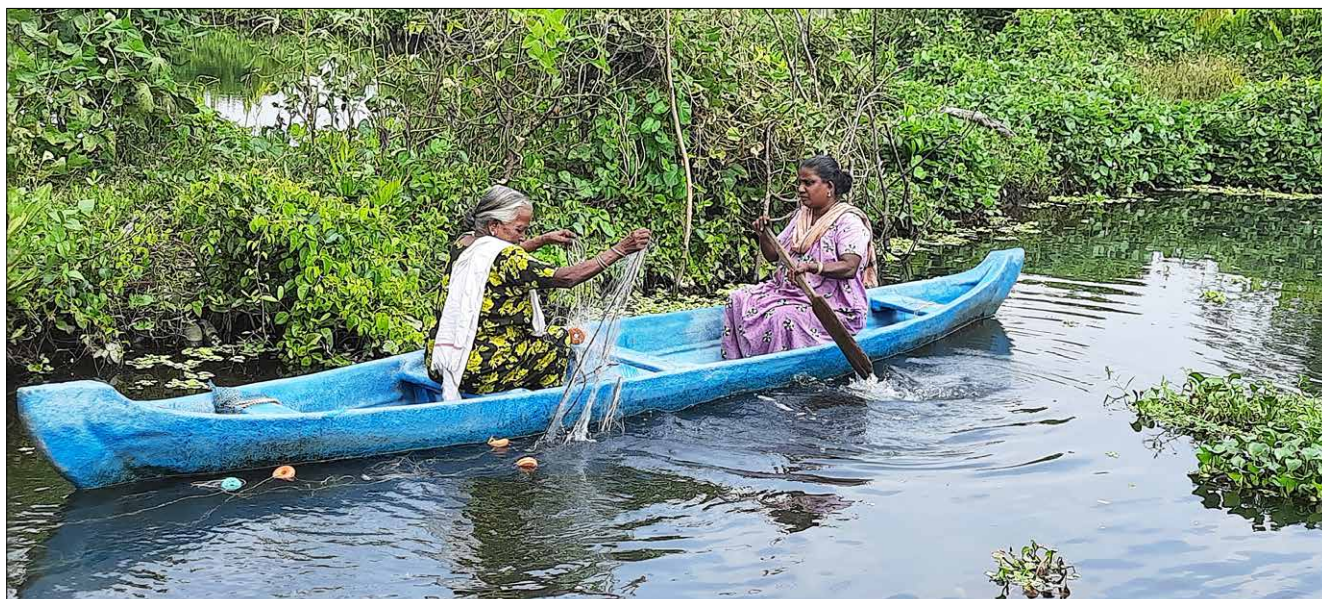
Gillnet fishing by inland fisherwomen at Valanthakad fishing village, Vembanad lake, Kerala, India. A major challenge to the availability of fish and fishery-based incomes in the estuary is the growing pollution of local water bodies