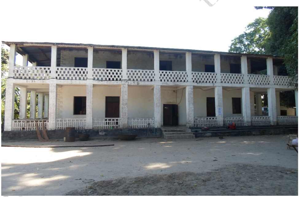
Figure 5. The Ukerewe Chief's palace