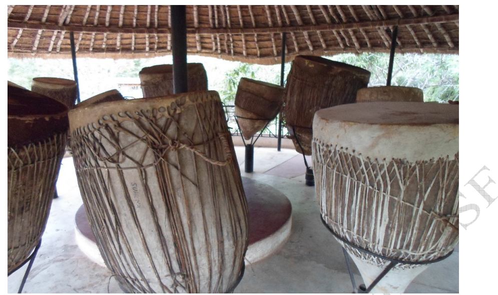
Figure 6. Drums used for various purposes among Sukuma tribe