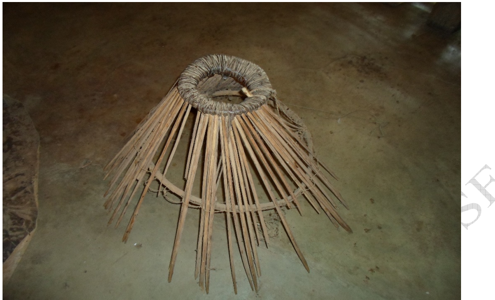
Figure 4. Fishing gear (Lusaka) used in Sukuma community