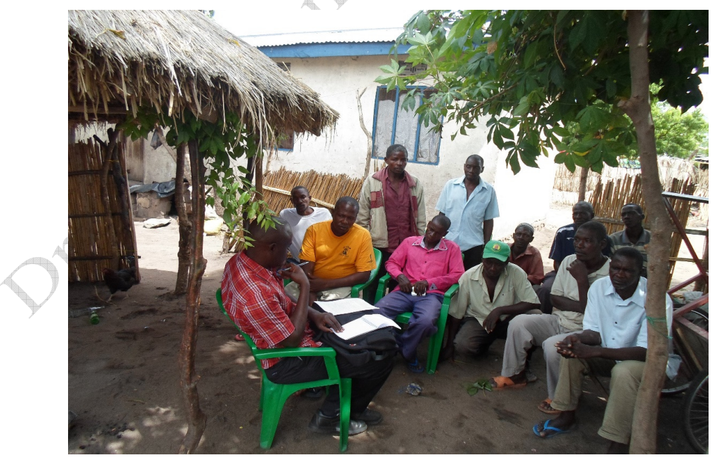
Figure 2. One of the FGD sessions at Chole village, Misungwi District.