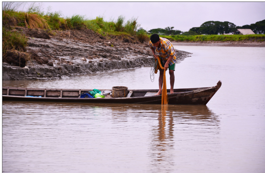
Cast net fishing in the flood plain of Kayin State, Myanmar. The 2018 freshwater fishery law of Ayeyarwaddy recognizes the rights of SSF and the co-management mechanism

Thirdly, the fish collectors and leaseholders were powerful and influential at all levels of decision making, with some going on to become parliamentarians in the first parliament of 2011-2015. Hence, until 2013 the early movement of SSF was not successful. Later they built larger,