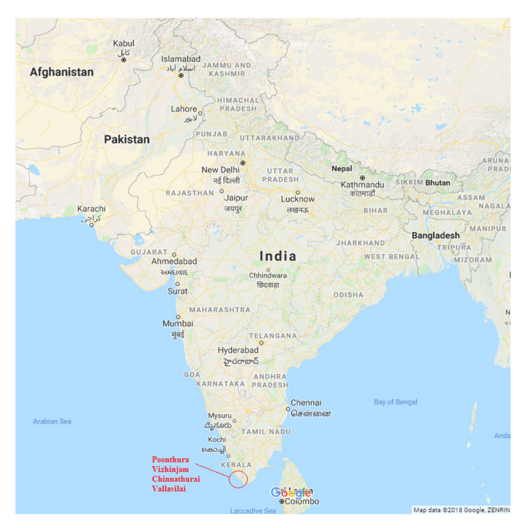
Map 1. Study locations