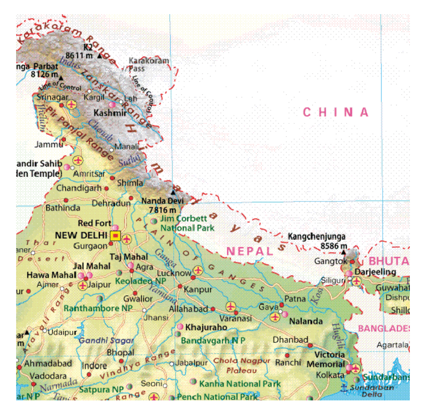
Map of Ganga basin