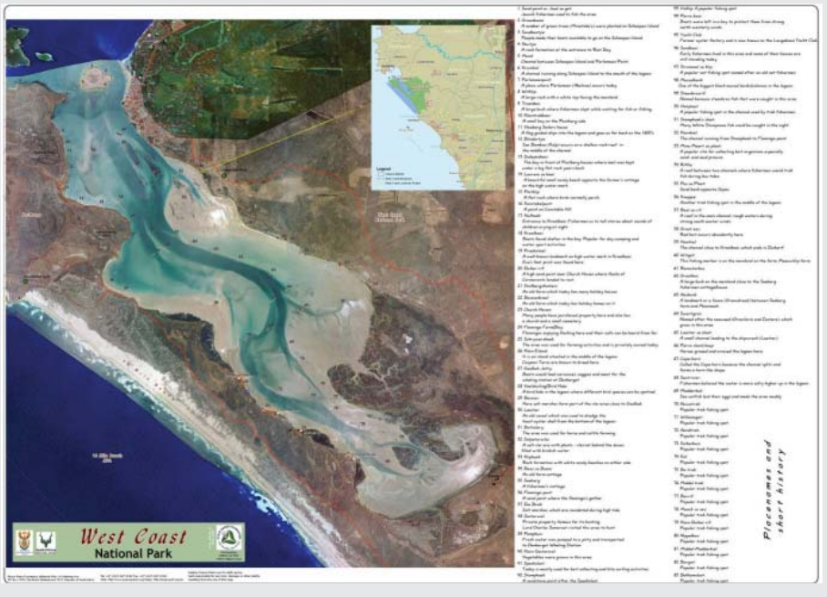
(Case example and map provided with kind permission by Pierre Nel, WCNP 2013)

In the Langebaan MPA within the West Coast National Park, the MPA has actively included persons from a local fishing family in documenting the cultural histories of the fishing communities in the Park.