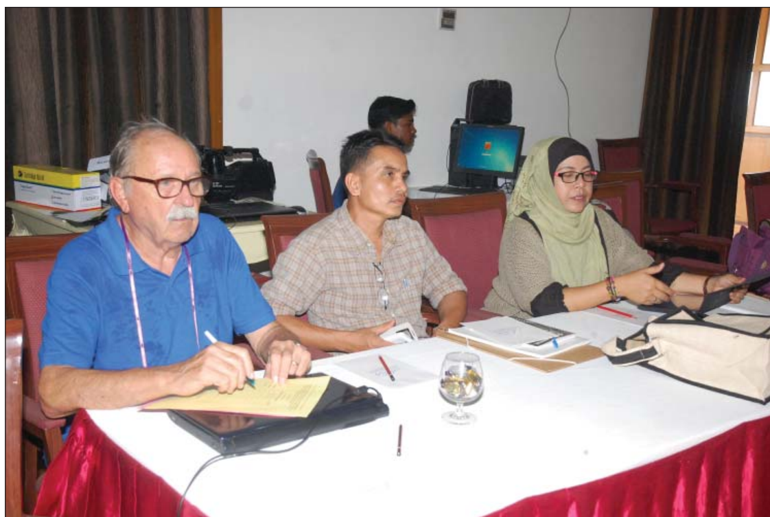
A panel discussion at the ICSF Pondy Workshop on the role of civil society organizations in the implementation of the FAO SSF Guidelines