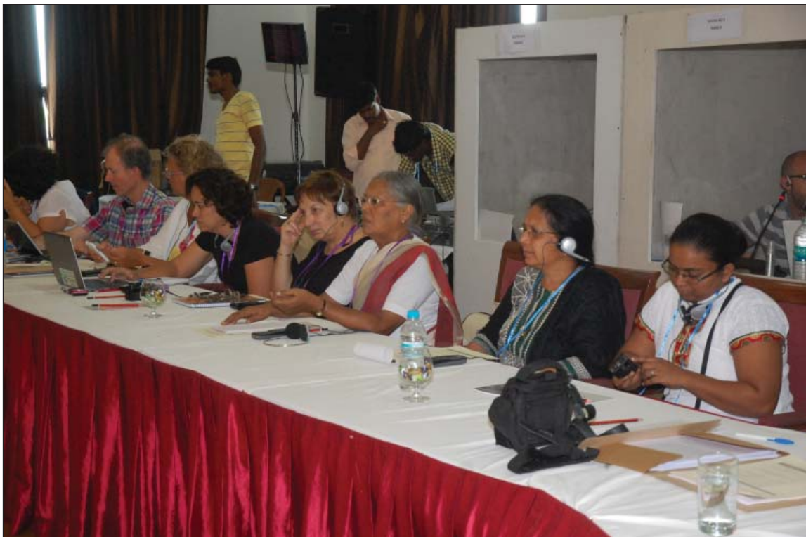
The Pondy Workshop set an agenda to put in place a strategic plan to collectively move forward to implement the FAO SSF Guidelines