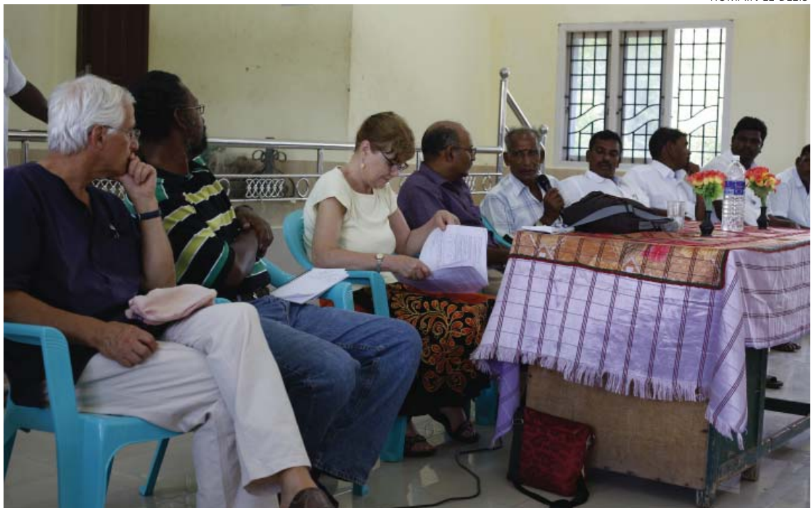
Participants discussing fisheries issues with the leaders of the Ooru panchayat at Nagapattinam, India. The Ooru panchayat is the local unit of governance in the district