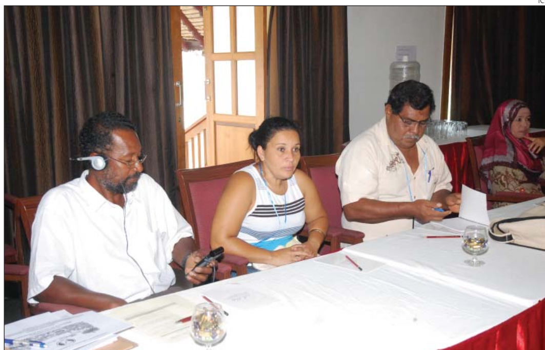
Participants at the Pondy Workshop were called on to provide inputs to feed into the Global Assistance Programme. The overall purpose of the approach is to mainstream the SSF Guidelines in various policies and strategies

http://igssf.icsf.net/images/ssf/FAO_Nicole%20Franz_16%20July-%20for%20print%201.pdf