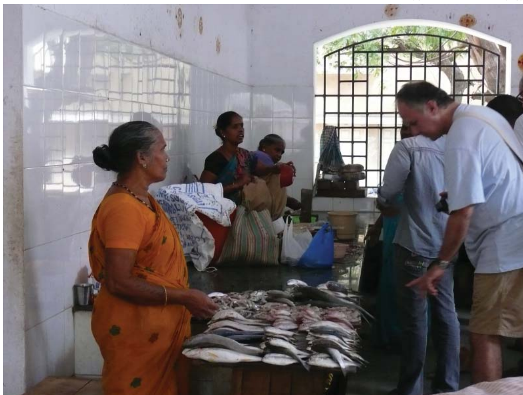
A fish market on Gingee Road, Puducherry. Twenty participants of the Pandy Workshop visited the fish market as part of the field trip