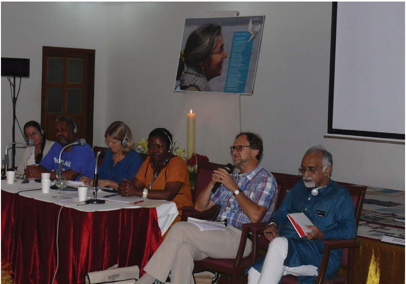
The concluding session of the ICSF Pondy Workshop. The meeting has unleashed a tremendous positive energy, which can be expected to take forward the process of implementation of the SSF Guidelines.