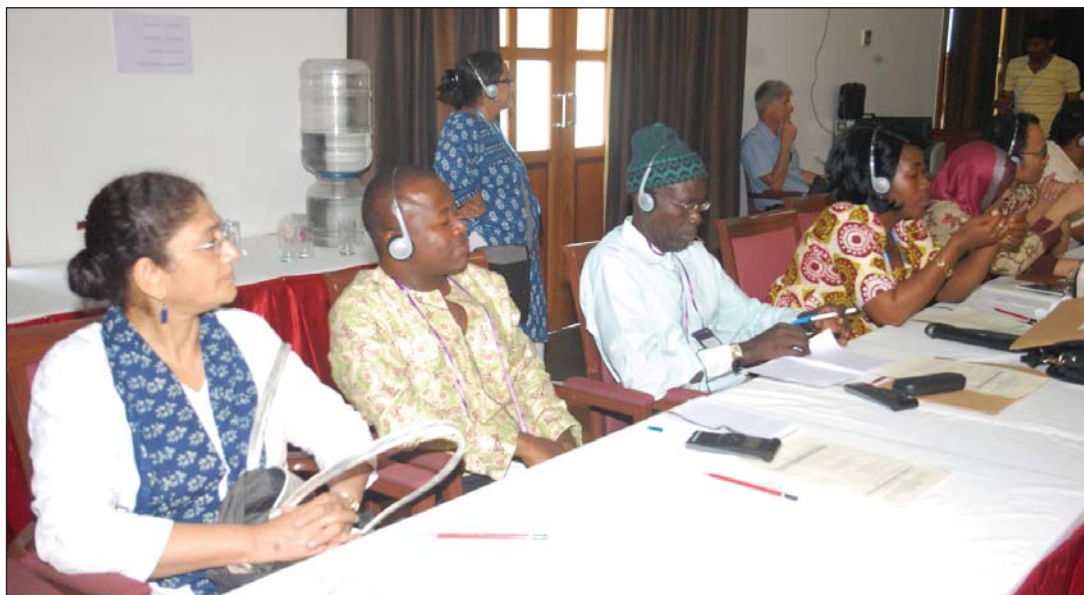
Gender mainstreaming, organization of women at the local level, and their education and livelihood opportunities were discussed at the Pondy Workshop on SSF Guidelines