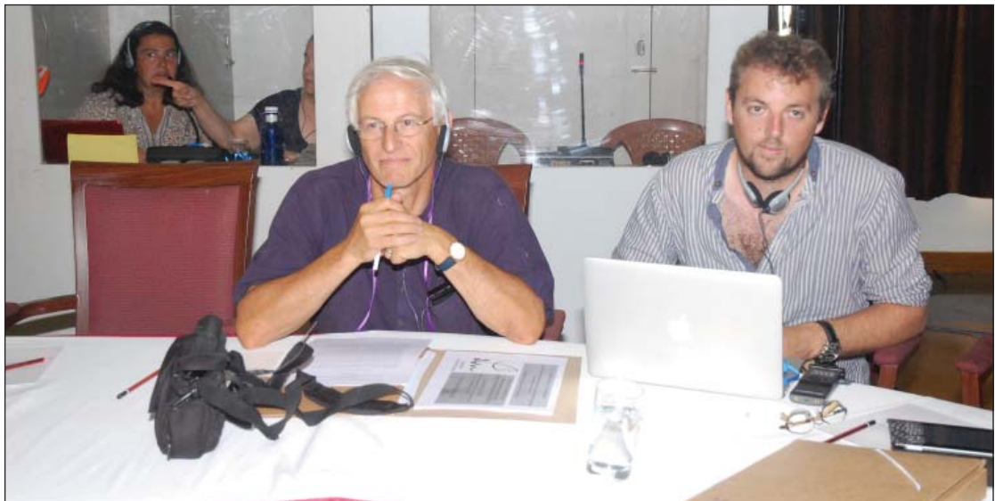
The multilingual interpreters at the workshop, some of whom have been associated with ICSF for over 20 years, provided participants the opportunity to share their experiences