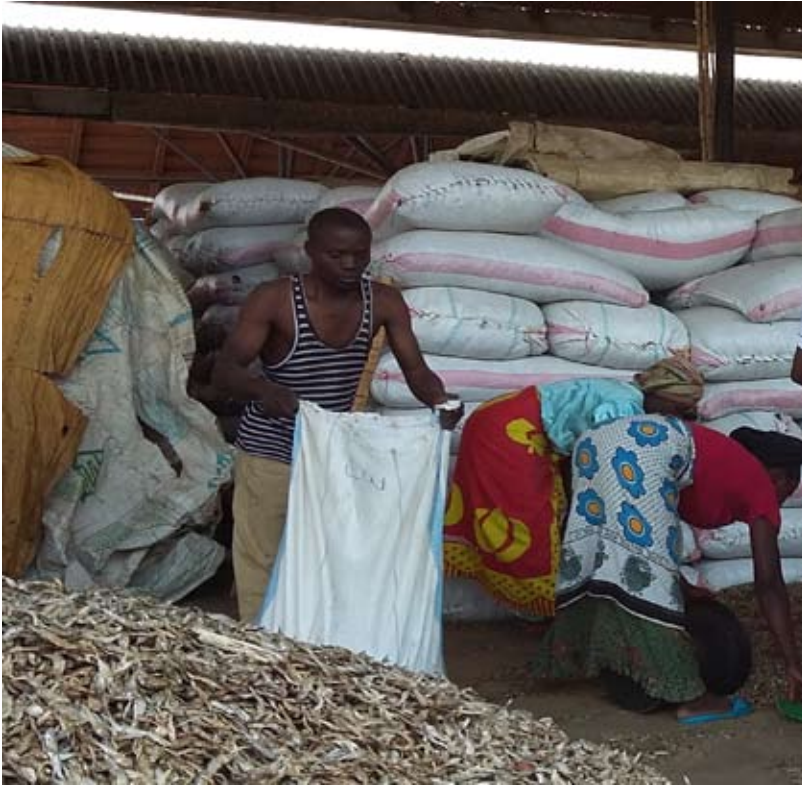
Picture 1: Women and men packaging dagaa in sacks ready for transportation at Kirumba International Fish Market